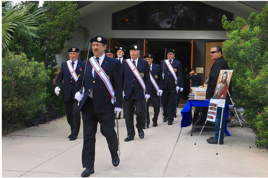
The 2794 Color Corps at the Blue Mass on Sunday, March 8 – the only activity of the month the Color Corps.