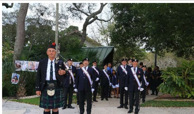
A bagpiper led the Color Corps for the annual Blue Mass on March 8.